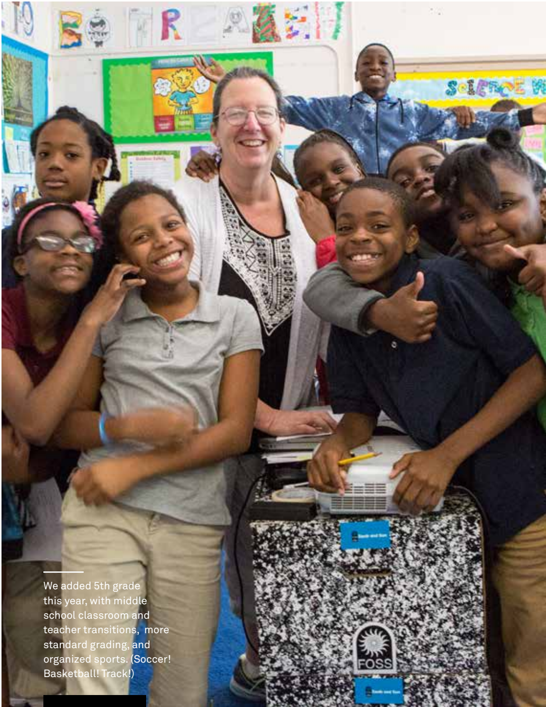
We added 5th grade this year, with middle school classroom and teacher transitions, more standard grading, and organized sports. (Soccer! Basketball! Track!)

When we say “whole child,” we mean the whole child. Three hours of math, reading, and writing a day—and improved scores to show for it—plus watercolors, weaving, clay, collage, Dvorak, diatonic scales, plotting the sun’s course in the universe, 27 independent reading books, and The Great Essay Project.