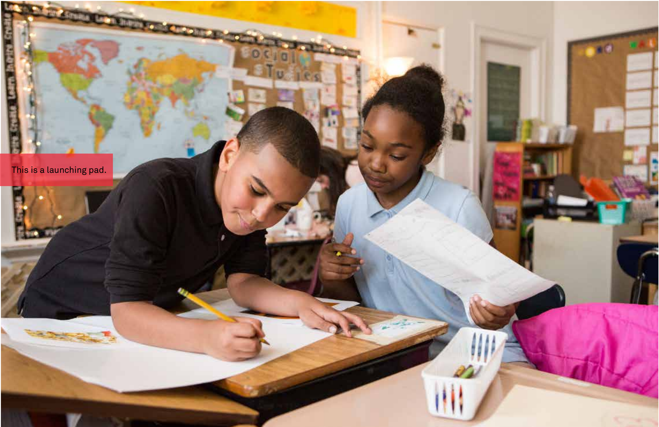
This is a launching pad.