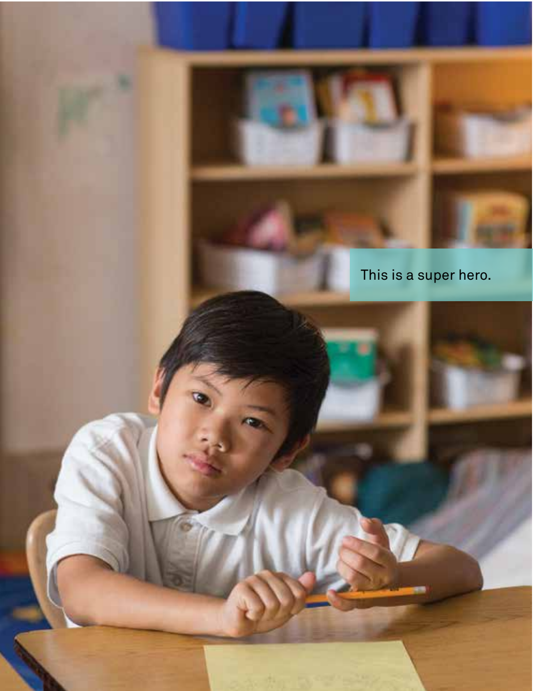
This is a super hero.